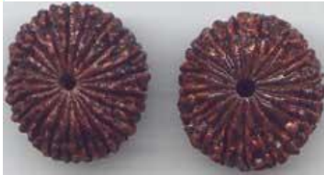
Fake beads carved out of betel nut. Method commonly used to make high mukhi beads upto 21 mukhi. Purchased in 1998, Varanasi, India.