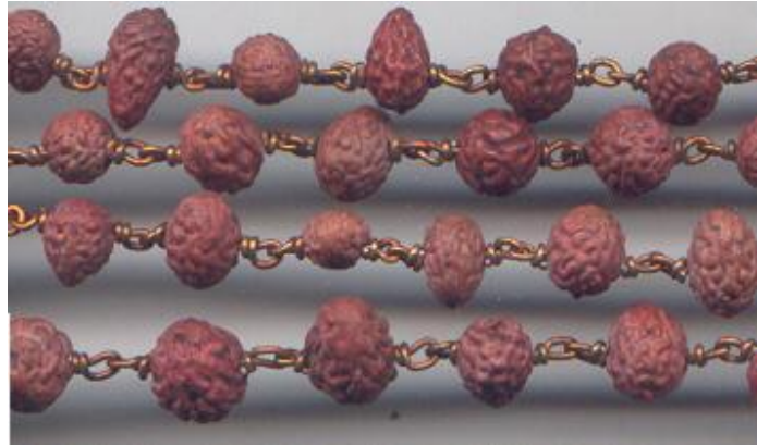
Seeds of Ber tree which are coloured and sold as rudraksha beads mala . Can be detected by sight as no mukhis are visible.