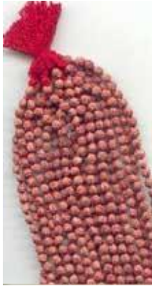
Fake mala of 108 + 1, 2 mukhi beads. Purchased in 1999, Indonesia. Now widely sold all over India.