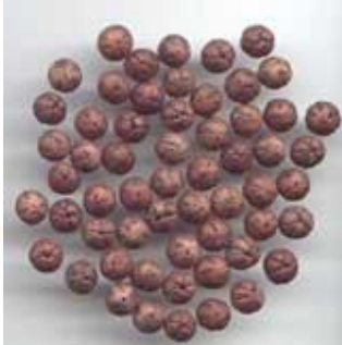
Fake beads carved out of Lotus Seeds Purchased in 1999, Haridwar India

In the interest of consumer protection and public education Rudra Center presents these pictures of Counterfeit One mukhi round Rudraksha beads that have been purchased in the past and kept. These beads are sold in large quantities in India and outside by unscrupulous people taking advantage of the craze of the customers to procure them. The typical price at which they are sold ranges from $100 to $50,000. Rudra Centre does not trade in round mukhis as they are not available at all. Even if you buy them for several 1000 dollars or from any ashrams or any reliable person, it would not be genuine as it has never been produced by any Tree in Nepal or Indonesia. It advises the people to not go in search for this Rudraksha, just because it is rare. Half moon 1 mukhi is genuine and available easily. However, it is sold at low price from Rudra Centre although there are people who sell this same bead at a price as much as $1100. Rudra Centre offers a free Authentication Service where there may be reasonable doubt regarding authenticity for any Rudraksha Beads purchased anywhere in the world. For this service the client pays shipping both ways to Rudra Centre. Another method of Authentication can take place by scanning Beads at high resolution and sending scanned pictures to Rudra Centre, India by email at rudracentreindia@yahoo.com .